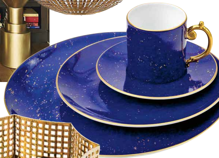
L'Objet's Lapis espresso cup and saucer set and canap and dessert plates; from $80. lobjet.com