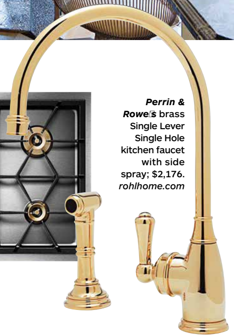
Perrin & Rowe's brass Single Lever Single Hole kitchen faucet with side spray; $2,176. rohlhome.com

TILES: COURTESY OF NEW RAVENNA; CHAIR: COURTESY OF KNOB; COOKTOP: COURTESY OF GAGGENAU; FAUCET: COURTESY OF ROHL