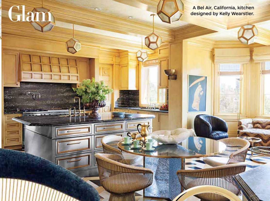
A Bel Air, California, kitchen designed by Kelly Wearstler.

Sherwin-Williams Stop paint; $30 per gallon. sherwinwilliams.com