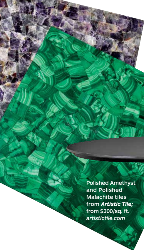
Polished Amethyst and Polished Malachite tiles from Artistic Tile ; from $300/sq. ft. artistictile.com