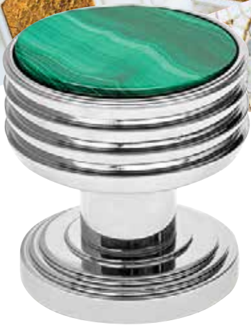
Sherle Wagner International's Keystone nickel doorknob is inset with malachite; price upon request. sherlewagner.com