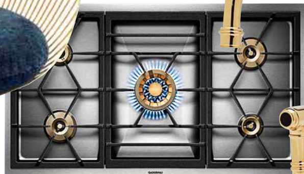
Gaggenau's VG 491 Vario five-burner gas cooktop; $3,599. gaggenau.com