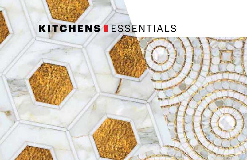
Ruche (far left) and Orson glass mosaic tiles by New Ravenna are accented with 24K gold; prices upon request. newravenna.com