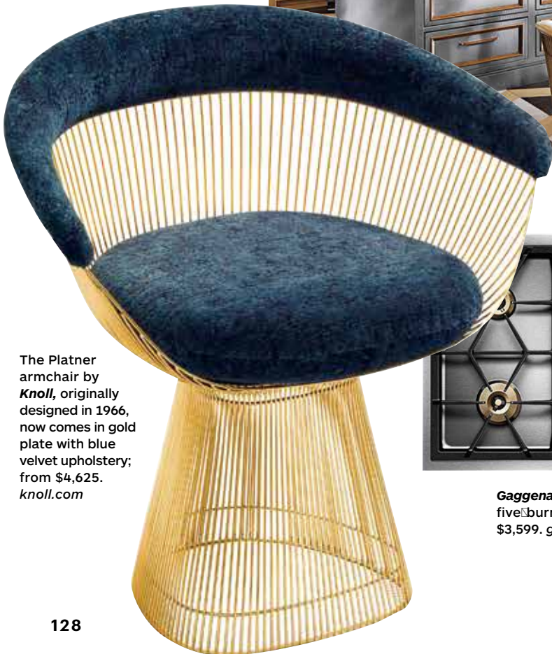
The Platner armchair by Knoll , originally designed in 1966, now comes in gold plate with blue velvet upholstery; from $4,625. knoll.com