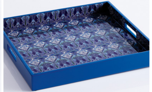
Liberty of London printed lacquer tray by Julian Mejia Design, $335; julianmejiadesign.com .