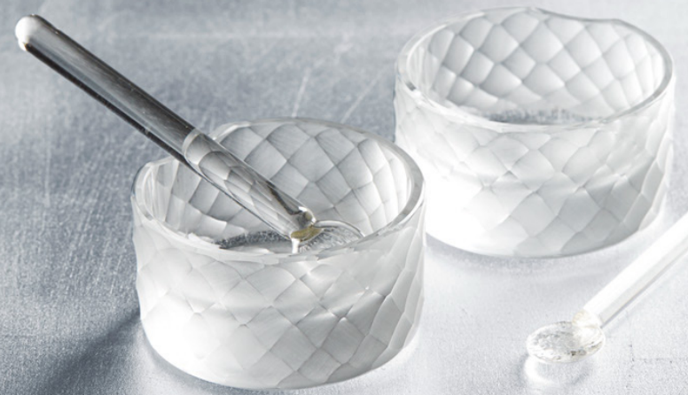
Murano-glass salt-and-pepper-cellar set by Bottega Veneta, $380; bottegaveneta.com .