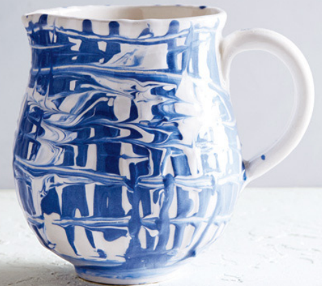
Claude earthenware pitcher by Frances Palmer Pottery, $325; francespalmerpottery.com .