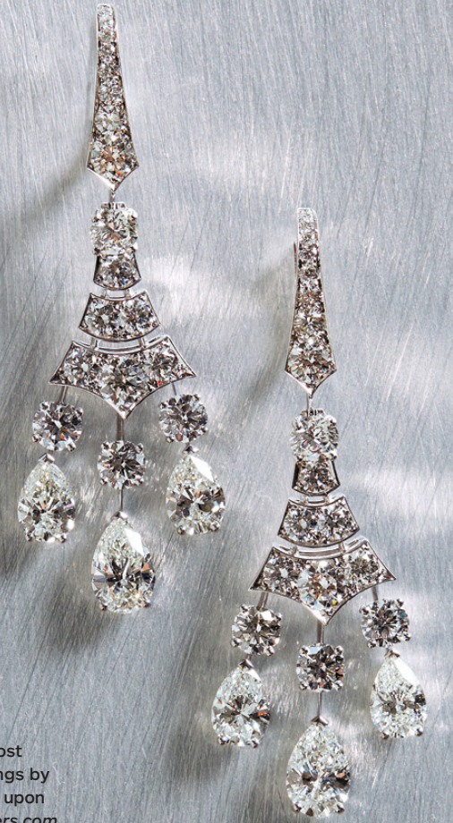
Phenomena Frost diamond earrings by De Beers, price upon request; debeers.com .