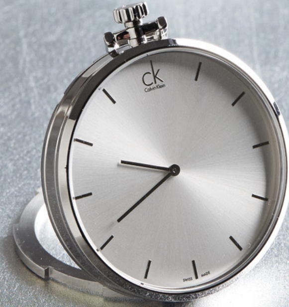
Two-inch-dia. timepiece (includes chain and leather wristband) by Calvin Klein, available through Macy's, $380; macys.com .