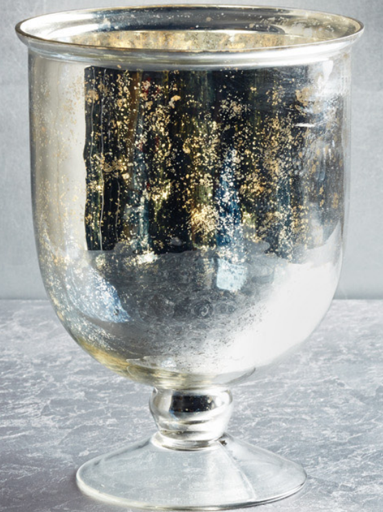
Mercury-glass hurricane lamp by Canvas, $63; canvashomestore.com .