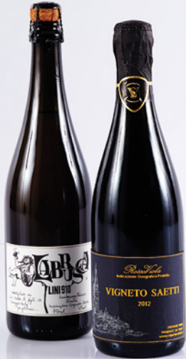
Artisan Lambrusco Duo sparkling-wine gift set from Pasanella & Son Vintners, $52; pasanellaandson.com .