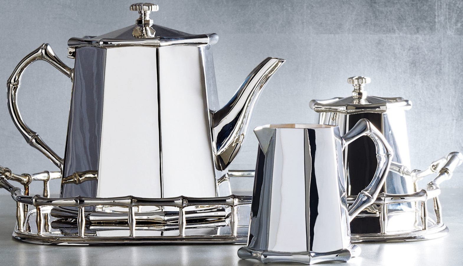
Abigail silver-plate tea set ($1,095) and serving tray ($795) by Ralph Lauren Home; ralphlaurenhome.com .

PRODUCED BY PARKER BOWIE LARSON