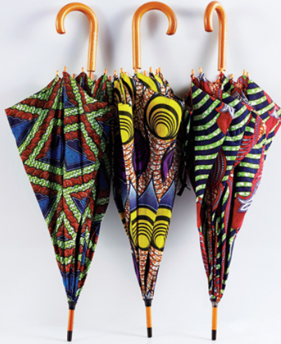
From left: Xai Xai, Bilen, and Ponto umbrellas by Babatunde, available through Fab, $45 each; fab.com .