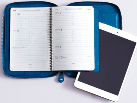
iPad Mini E-Zip calfskin case ($1,950) and agenda ($115) by Hermès; hermes.com .