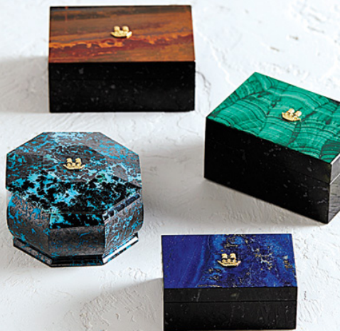
From top: Tigereye, malachite, shattuckite, and lapis lazuli boxes by Verdura, $775–$975 each; verdura.com .