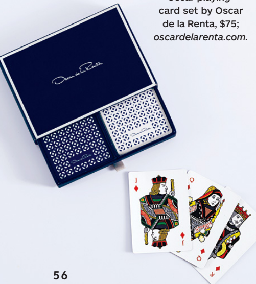
Oscar playing-card set by Oscar de la Renta, $75; oscardelarenta.com .