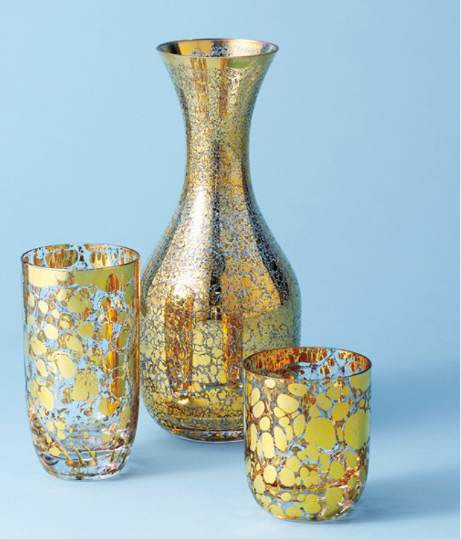
Crackle glass decanter ($305), tumbler ($126), and double old-fashioned glass ($105) with 24K-gold flecks, by Kim Seybert, available at Gracious Home; gracioushome.com .