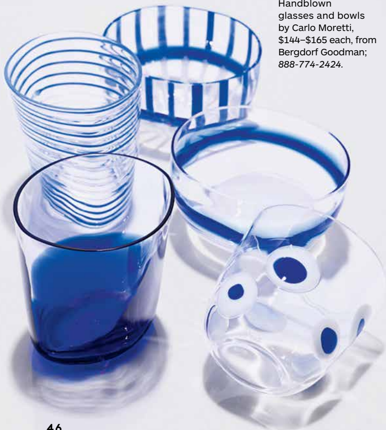
Handblown glasses and bowls by Carlo Moretti, $144-$165 each, from Bergdorf Goodman; 888-774-2424.