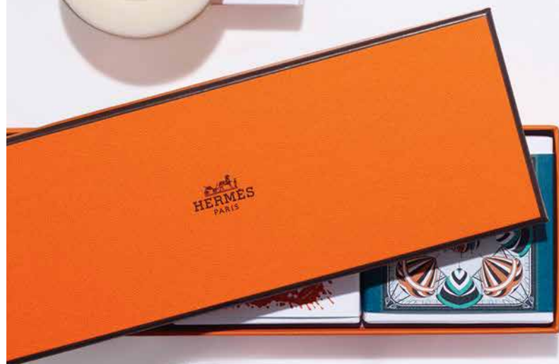
Le Bain soaps by Hermès, $63 for a set of three; hermes.com .