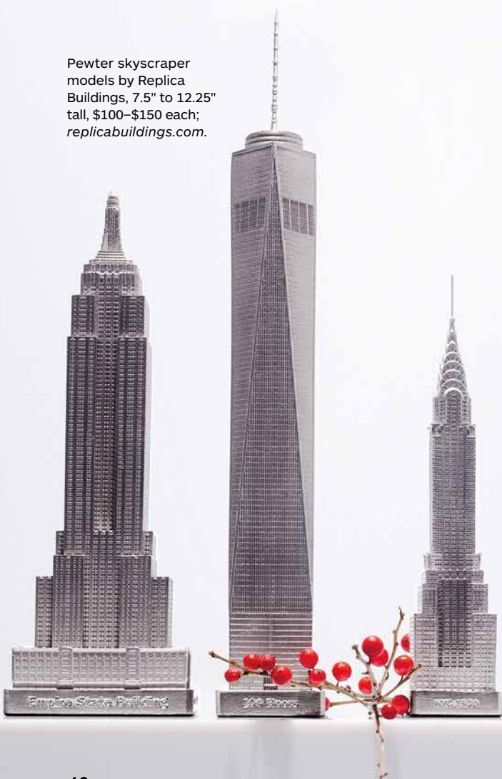
Pewter skyscraper models by Replica Buildings, 7.5" to 12.25" tall, $100-$150 each; replicabuildings.com .