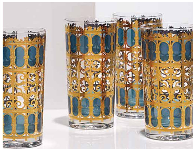
Vintage gilded highball glasses from La Maison Supreme, $49 each; laisonssupreme.com .