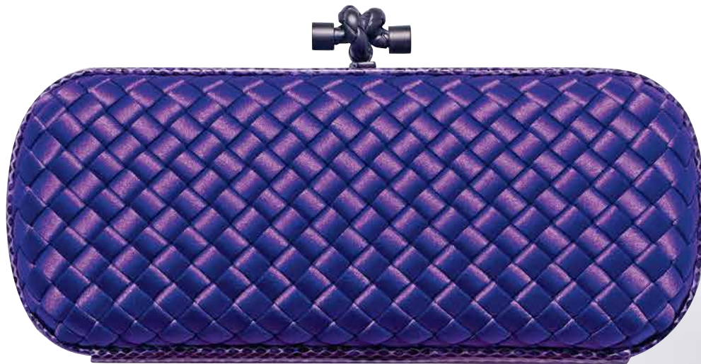
Intreccio Ayers Byzantine stretch-knot satin clutch by Bottega Veneta, $1,750; bottegabeneta.com .