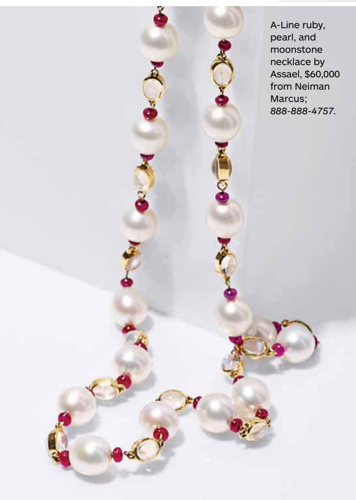
A-Line ruby, pearl, and moonstone necklace by Assael, $60,000 from Neiman Marcus; 888-888-4757.