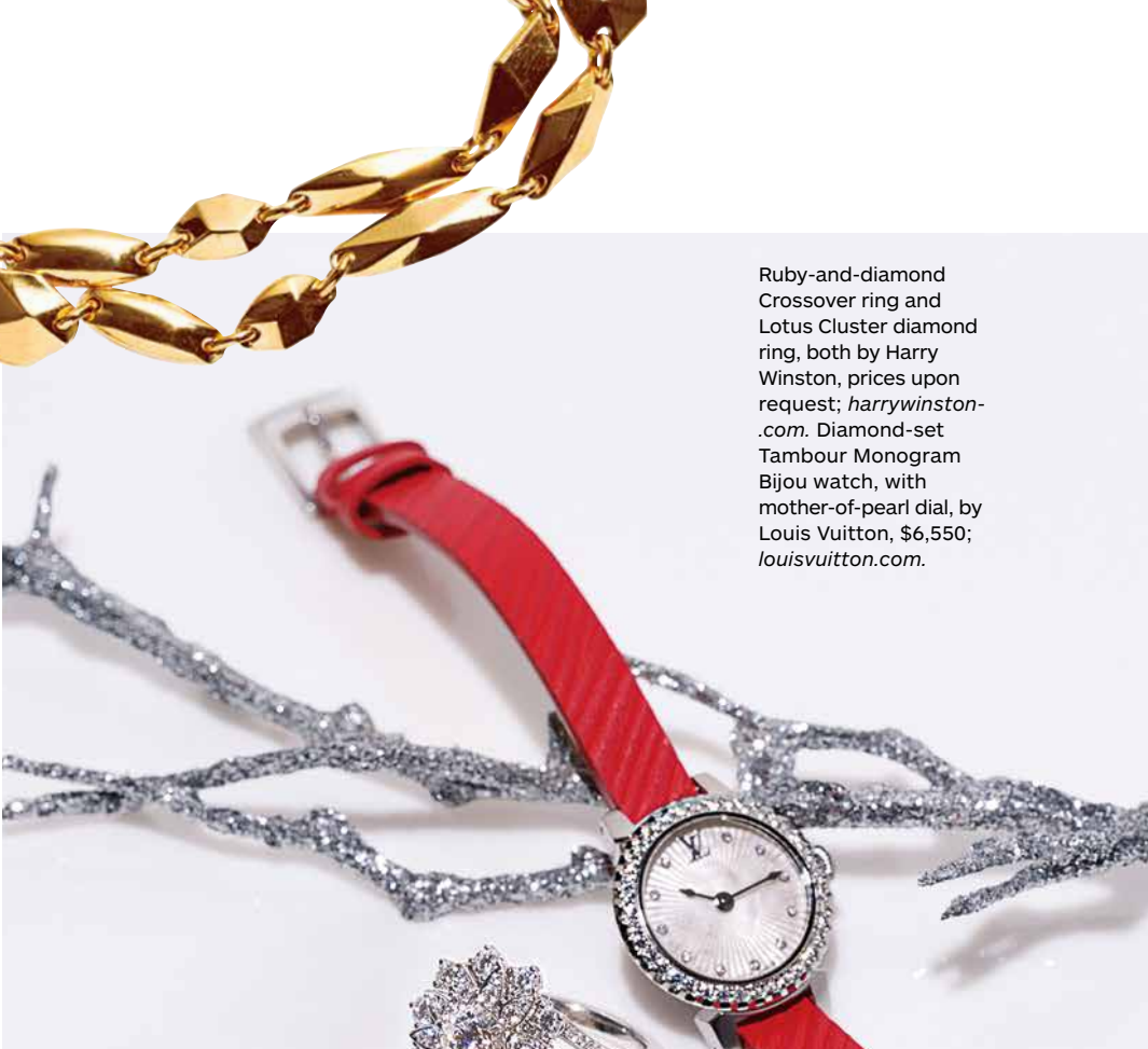
Ruby-and-diamond Crossover ring and Lotus Cluster diamond ring, both by Harry Winston, prices upon request; harrywinston.com . Diamond-set Tambour Monogram Bijou watch, with mother-of-pearl dial, by Louis Vuitton, $6,550; louisvuitton.com .