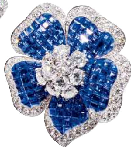
Gloxinia earrings, with diamonds and mystery-set sapphires, by Van Cleef & Arpels, price upon request; 877-826-2533.