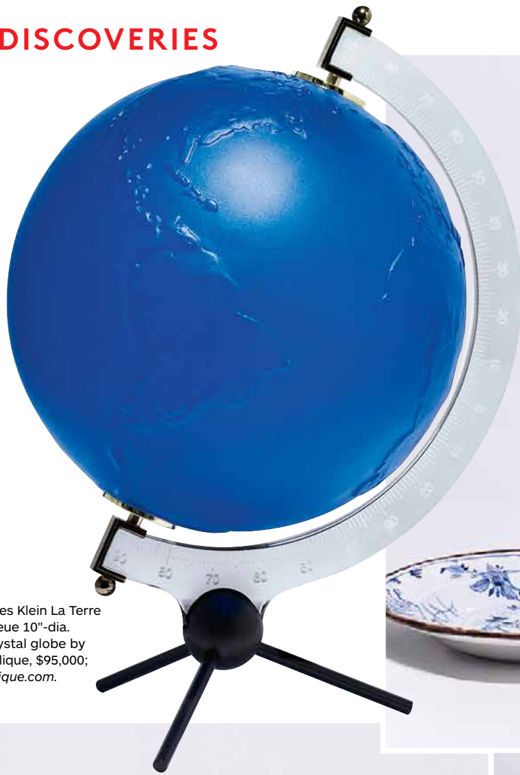
Yves Klein La Terre Bleue 10"-dia. crystal globe by Lalique, $95,000; lalique.com .