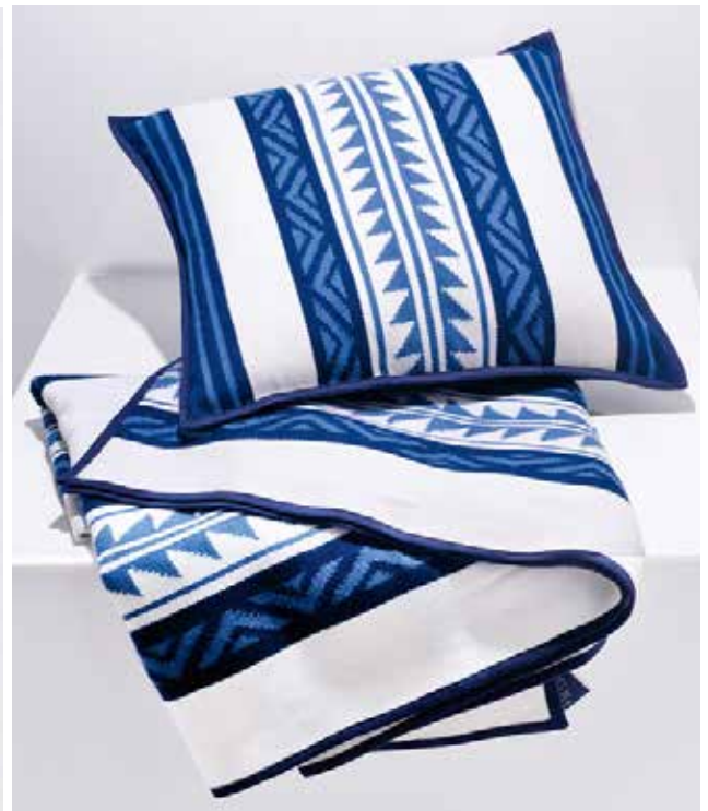
Breton Bay cashmere accent pillow ($1,695) and suede-trimmed throw ($5,995) by Ralph Lauren Home; ralphlaurenhome.com .