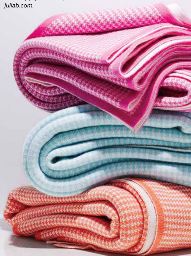
Houndstooth-pattern cashmere throws by Julia B., $1,500 each; juliab.com .