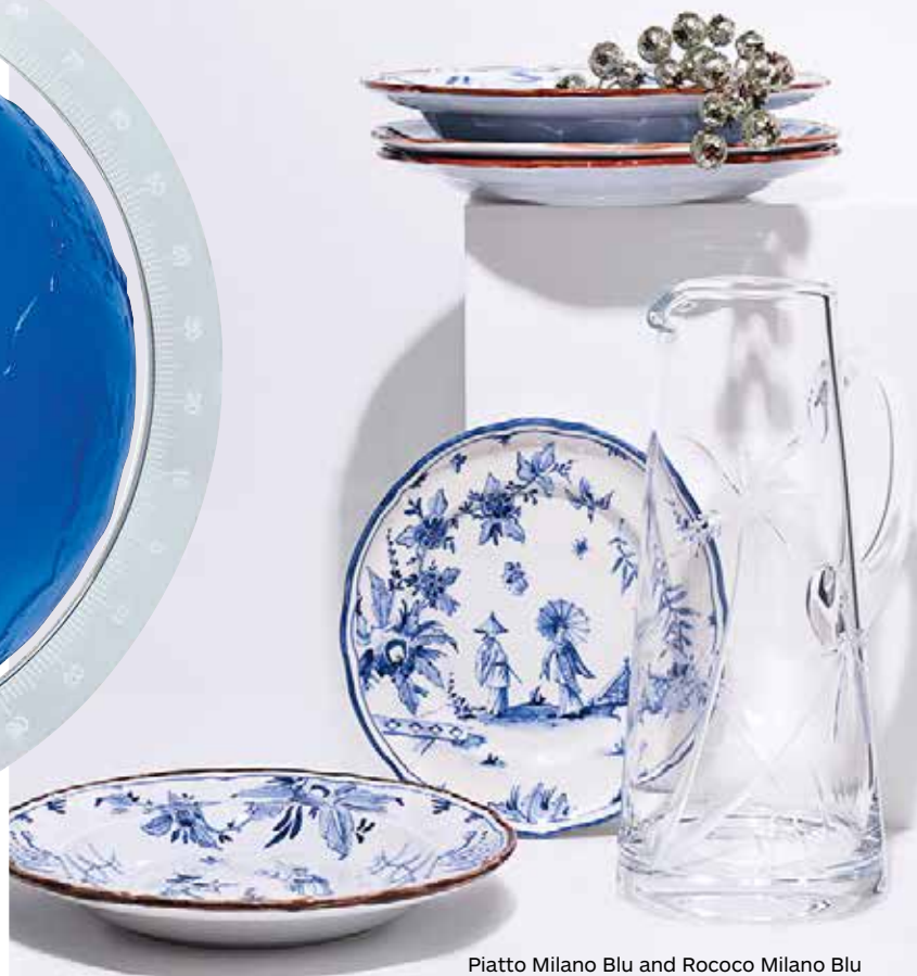
Piatto Milano Blu and Rococo Milano Blu ceramic tableware from Artemest, $250 per piece; artemest.com . Palmyra handblown pitcher by William Yeoward Crystal, $195; williamyeowardcrystal.com .