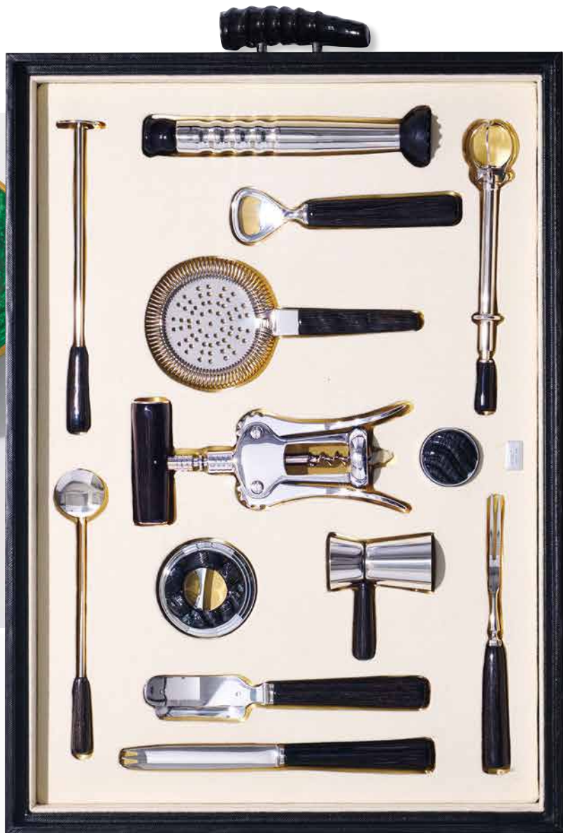
Set of bamboo-handled bar tools in leather-wrapped case, by Cedes Milano, $3,800 from Moda Operandi; modaoperandi.com .