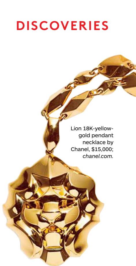
Lion 18K-yellow-gold pendant necklace by Chanel, $15,000; chanel.com .